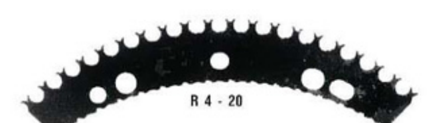
R 4 - 20