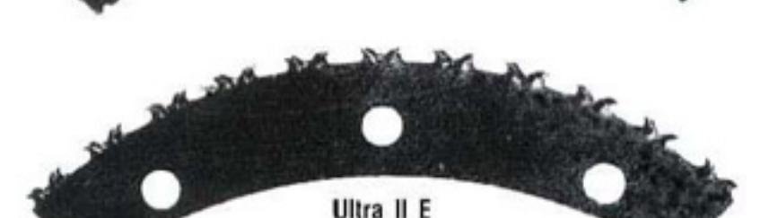
Ultra II E