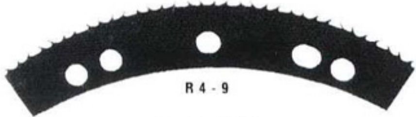
R 4 - 9