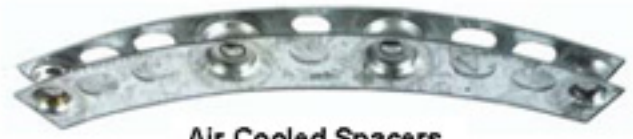
Air Cooled Spacers