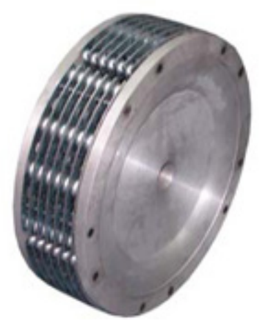
R4 & R115 Hup