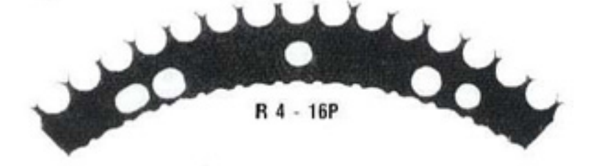
R 4 - 16P