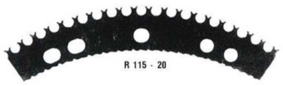
R 115 - 20