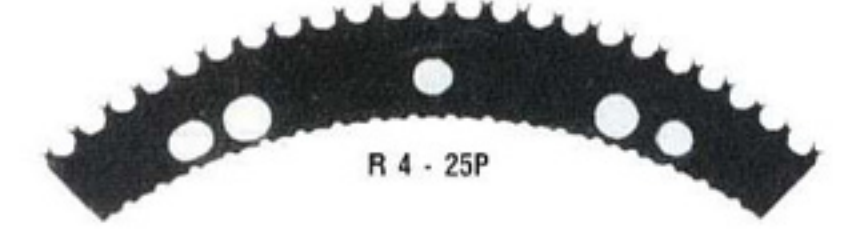
R 4 - 25P